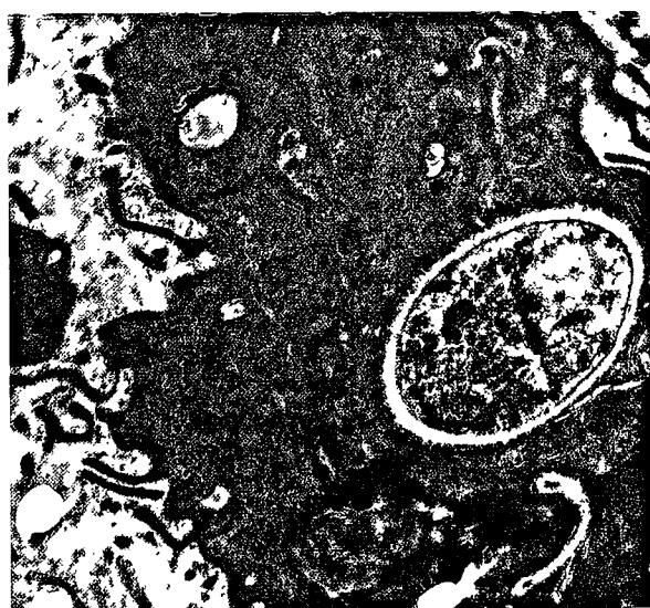
Fig. 4 Electron microscopy of Histoplasma farciminosum ( \times 10,000 )

Tissues taken from cutaneous lesions revealed the presence of oval bodies (8, 28). Most of the details of the fine internal structures could be observed (Fig. 4).