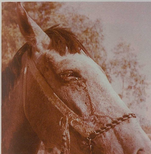
Fig. 1 A button-like growth on the eyelid of the right eye in a seven-year-old Arabian horse

The ophthalmic form of the disease is less frequent. Infection may occur as conjunctivitis or a naso-lachrymal infection (Fig. 1). Several authors have reported lachrymal and conjunctival lesions as the sole symptoms among equines in Egypt (17, 21, 22). The infection rarely becomes generalised (3, 20, 38). Initial infection is characterised by a watery discharge from one or both eyes and some swelling of the eyelids, followed by the development of papules and ulcerating button-like growths on the conjunctiva and/or on the nictitating membrane (5, 54, 58).